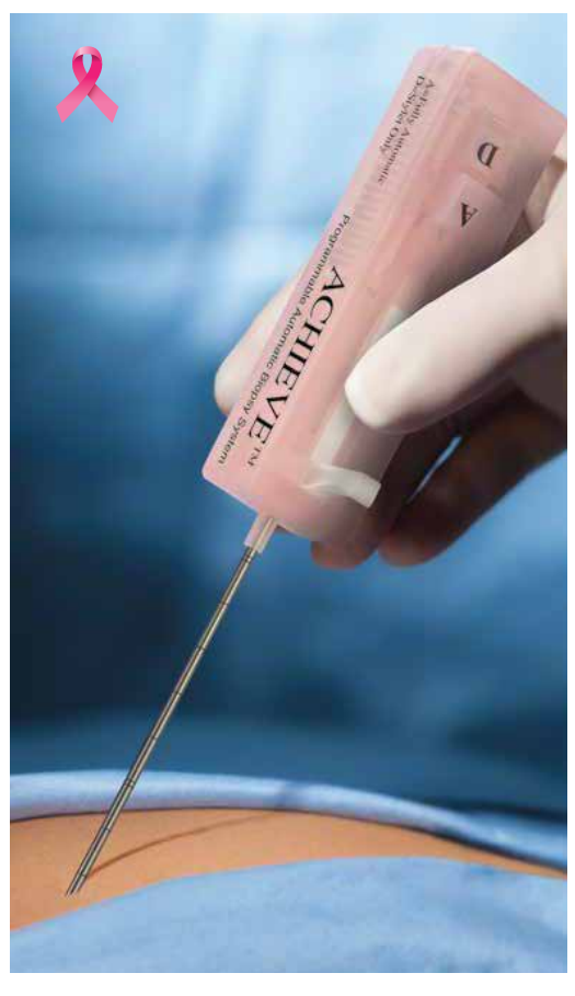
Pink Achieve is designed for breast biopsy with larger gauge size.

Reliable sample retrieval reduces risk of sample loss